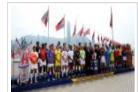
HK: Sevens Season