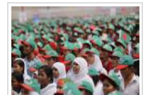
Half a million sing, setting