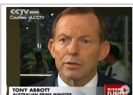
MH370: Abbott hopeful over credible leads