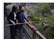
When US first lady meet