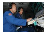
Xuelong hunts for debris