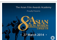
8th Asian Film Awards