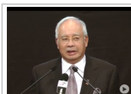
Flight MH370 ended in southern Indian Ocean,

Contact the writers lixiang@chinadaily.com.cn and zhouwa@chinadaily.com.cn .